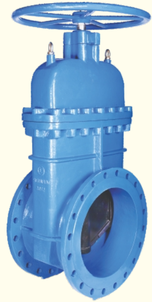
Fig. 2 DN 350-600

SIGMAFLOW Resilient Seated Gate Valve is of lightweight design and construction of ductile iron offers a robust and durable extended life performance. Valves can either be used above ground or buried service applications and are maintenance free. The valves seal 100% leak tight. The waterway is clear, unobstructed and free from pockets to allow smooth flow of water.