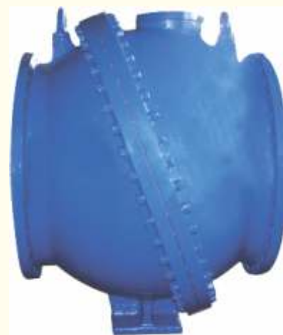
Fig. 1 DN 700-1200

SIGMAFLOW Non Return Valves are available in different dimensions as per the specific needs of clients. Meticulously tested on various quality parameters to ensure its performance, the product is manufactured using latest technology for sturdy construction, durability, accurate dimensions and smooth finish.